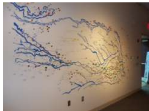
One of the artist’s interpretive works – A Nebraska map showing the locations of the 4,000 monitoring wells in the state represented by different sizes & colors of pom-poms.

Visit the Norfolk Airfest on June 15 th & 16 th One of the largest air shows to take place in Northeast Nebraska! State fly-in, hot air balloons, Army Golden Knights Parachute Team, dog fights, State Fly-in breakfast at the Norfolk Regional Airport. www.nebraskaairfest.com